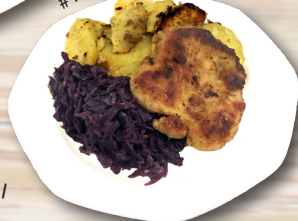
#14. Schnitzel Meal