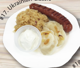
#17. Ukrainian Classic