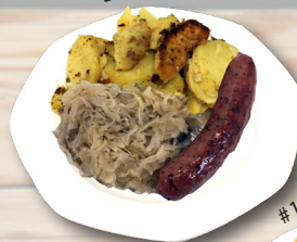
#13. Octoberfest Bratwurst