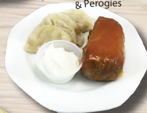
#18. Cabbage Roll & Perogies