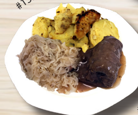
#15. Rouladen Meal