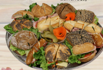
#21 ~Luxury Luncheon