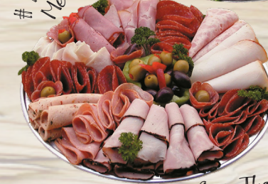
#19 ~ The Nibbler