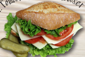
#6. Tomato cheese Pleaser