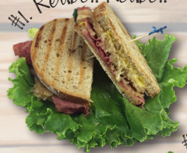
#1. Reuben Reuben