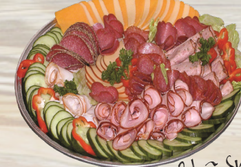
#21 ~ Sweet Sensation