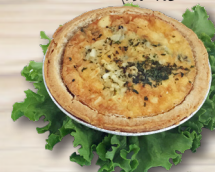
#1. Vegetarian Quiche