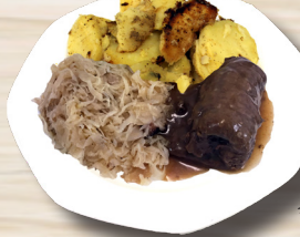
#11. Rouladen Meal