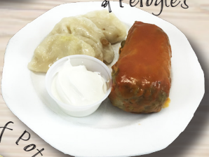
#14. Cabbage Roll & Perogies