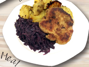
#10. Schnitzel Meal