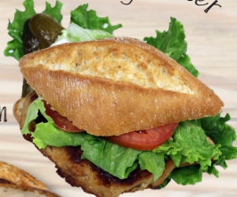
#2. King Kaiser