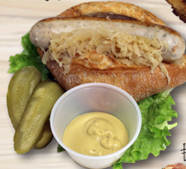
#3. Beer Garden Classic