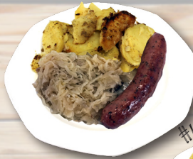
#9. Octoberfest Bratwurst