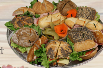
#17 ~ Luxury Luncheon