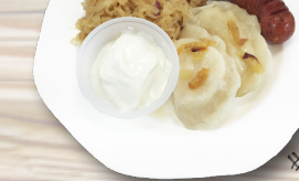
#13. Ukrainian Classic