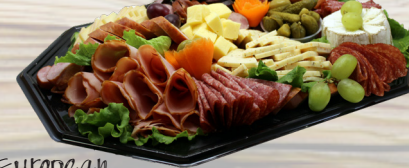
#20. European Elegance