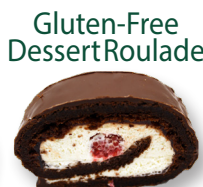
Gluten-Free Dessert Roulade