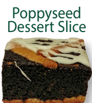
Poppyseed Dessert Slice