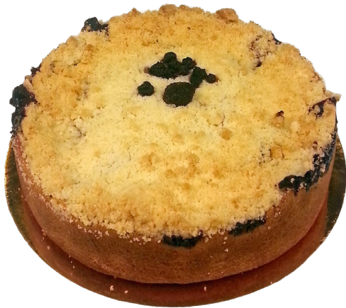
Streuselkuchen (Crumble Cake)

Your choice of Blueberry, Plum, or Apple fruit-filled 9" streusel cake